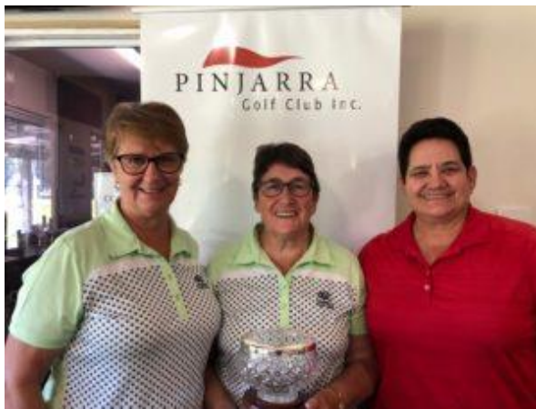
2018 Nora Watts Trophy winners Gosnells Golf Club