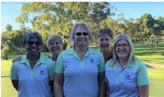
2018 Eileen Dawson trophy: Gosnells Golf Club