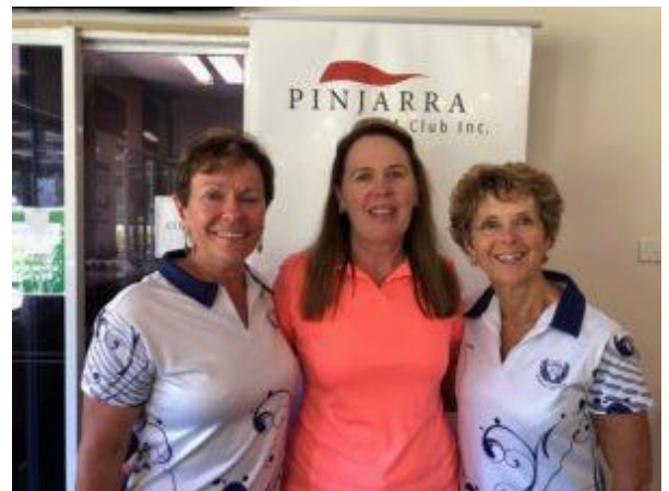
2018 Nora Watts Trophy runners-up Bunbury Golf Club